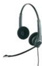
f g h i j k l GN2000 Serie