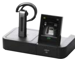
☐ ☐ GO 6400 Serie