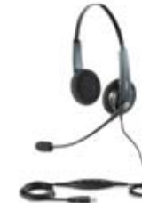
r s BIZ 620 Serie