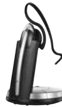
☐ ☐ ☐ GN9300 Serie