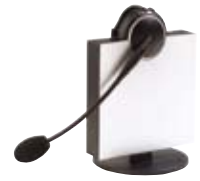
☐ ☐ ☐ ☐ ☐ GN9120 Serie