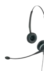
c d GN2100 Serie