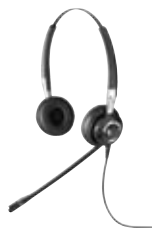
k l m n o BIZ 2400 Serie