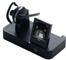
☐ ☐ ☐ PRO 9400 Serie